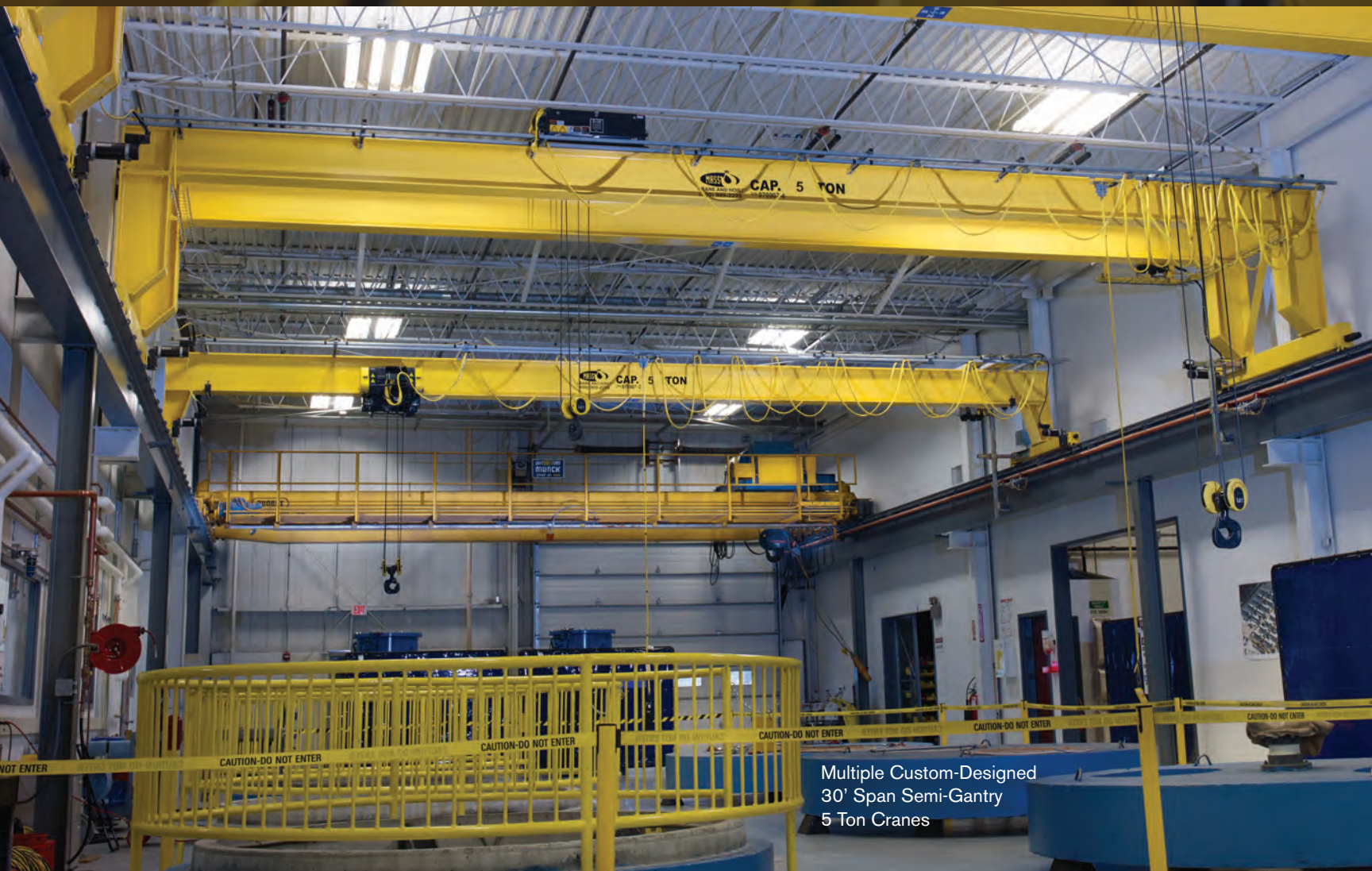
Multiple Custom-Designed 30' Span Semi-Gantry 5 Ton Cranes