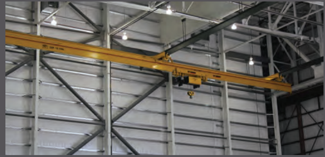
Patented Track Cranes