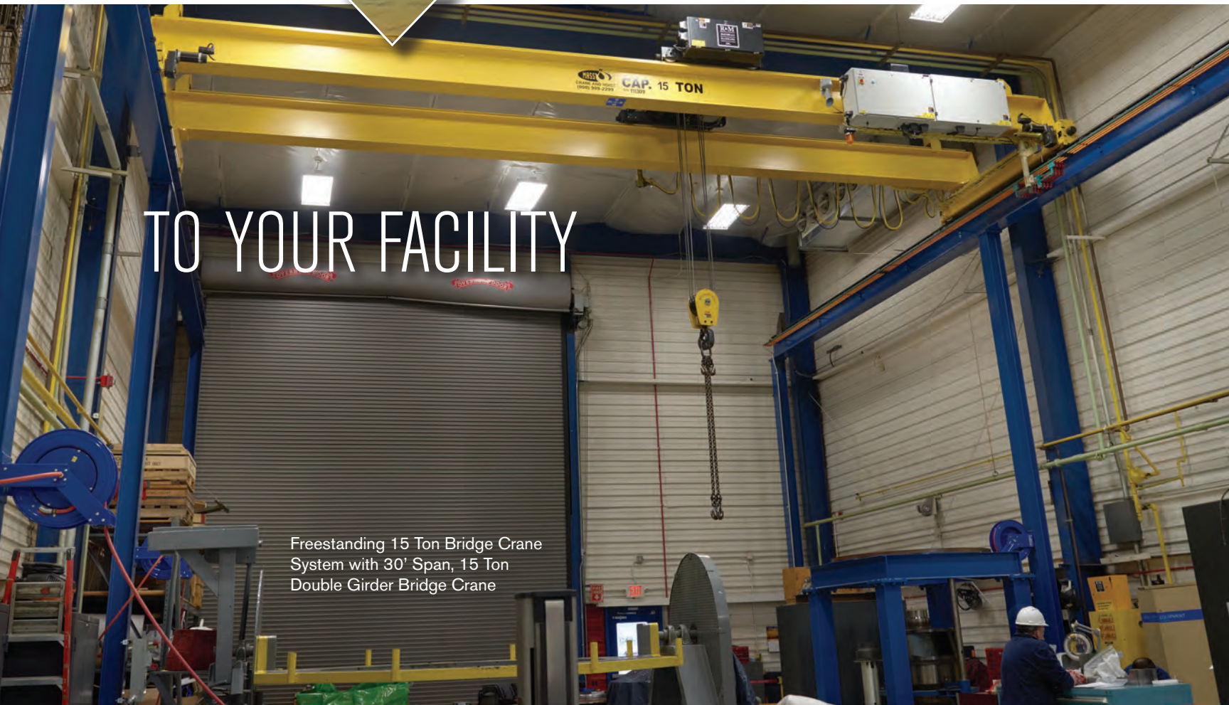
Freestanding 15 Ton Bridge Crane System with 30' Span, 15 Ton Double Girder Bridge Crane

Our engineers have great stories to tell. They can tell you about the 200 Ton crane for Westinghouse that they installed from inside the building with very little headroom in a 12-day window during Christmas shutdown; or the twin 15 Ton 105' span full catwalk cranes they built for a major New England service center in under 5 months; or the 20 Ton, 45' span double girder crane installed 300 ft below ground in Providence, RI. MA Crane's engineers have done it all, and they're looking for the next challenge. Whether your application is small or large, simple or beyond belief, the path to success starts with the smartest, most experienced minds in crane design.