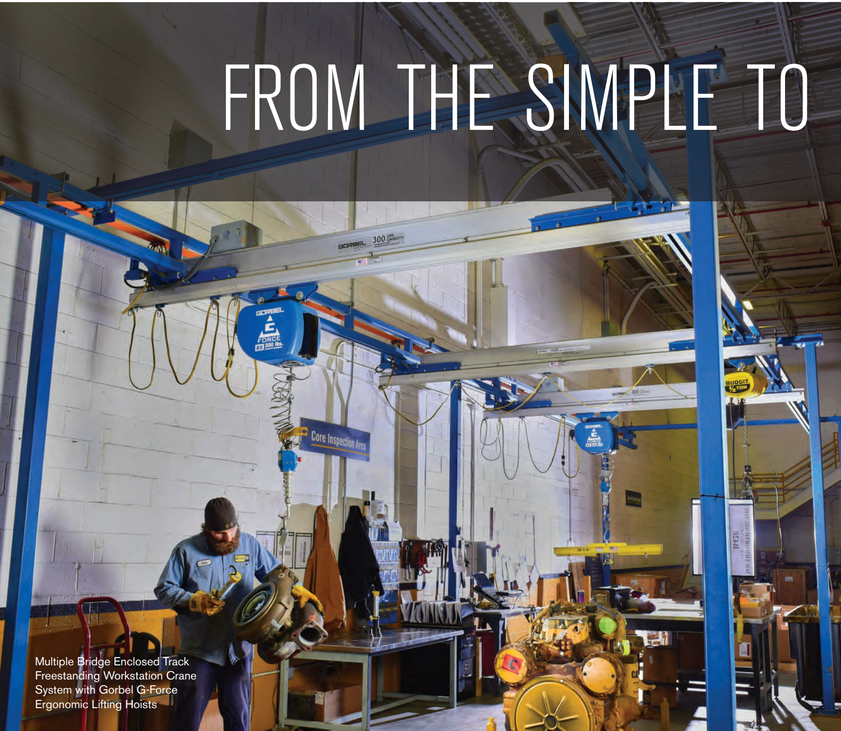
Multiple Bridge Enclosed Track Freestanding Workstation Crane System with Gorbel G-Force Ergonomic Lifting Hoists