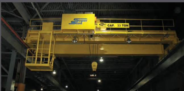
Double Box Girder