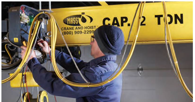
On-site inspection using Mass Crane's proprietary Tracker software