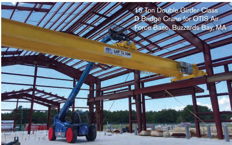
15 Ton Double Girder Class D Bridge Crane for OTIS Air Force Base, Buzzards Bay, MA

in bringing your crane system to life with smooth, flawless, and problem-free efficiency. We set high standards, and it shows in system reliability and performance.