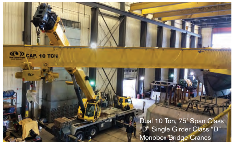
Dual 10 Ton, 75' Span Class "D" Single Girder Class "D" Monobox Bridge Cranes