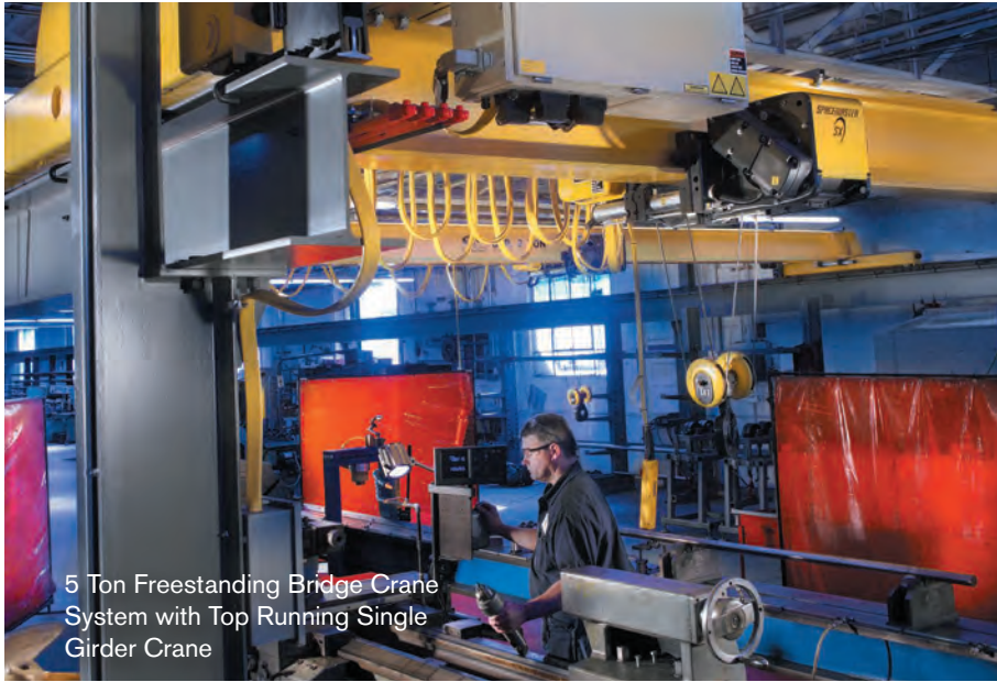
5 Ton Freestanding Bridge Crane System with Top Running Single Girder Crane