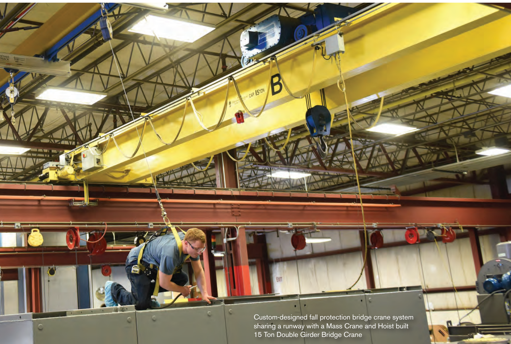
Custom-designed fall protection bridge crane system sharing a runway with a Mass Crane and Hoist built 15 Ton Double Girder Bridge Crane