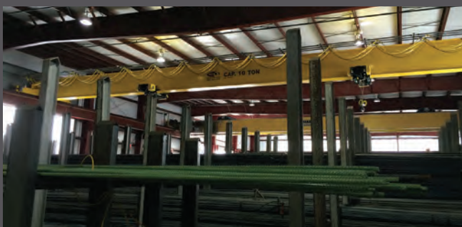
Mono Box Girder