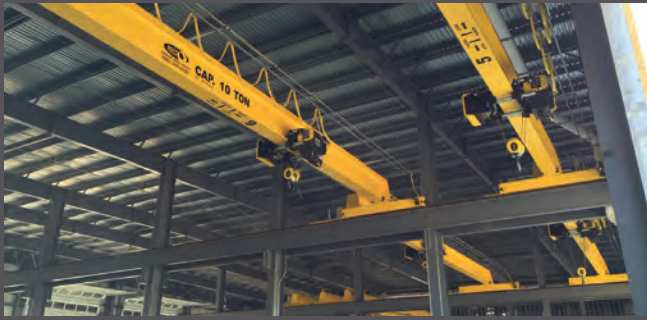
Single Girder Top Running