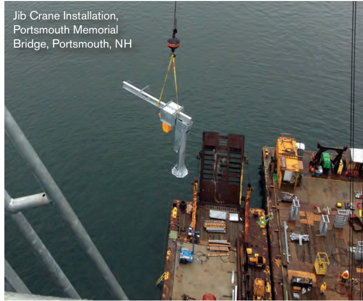
Jib Crane Installation, Portsmouth Memorial Bridge, Portsmouth, NH